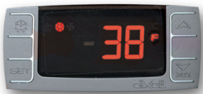
Adjustable Digital Thermostat! Easy to read display

RIGHT-SIDE COMPRESSOR CONFIGURATION AVAILABLE. CONTACT OUR SALES TEAM TO LEARN MORE.