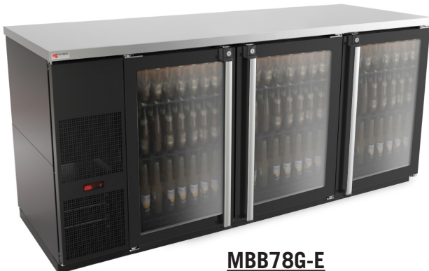
MBB78G-E Black with Glass Doors