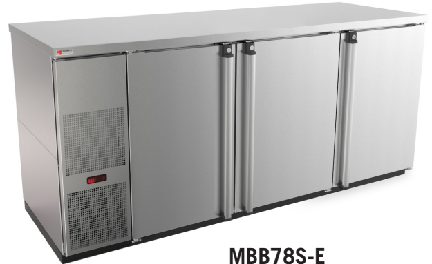
MBB78S-E Stainless Steel