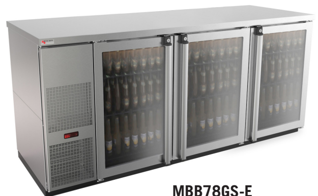
MBB78GS-E Stainless Steel with Glass Doors