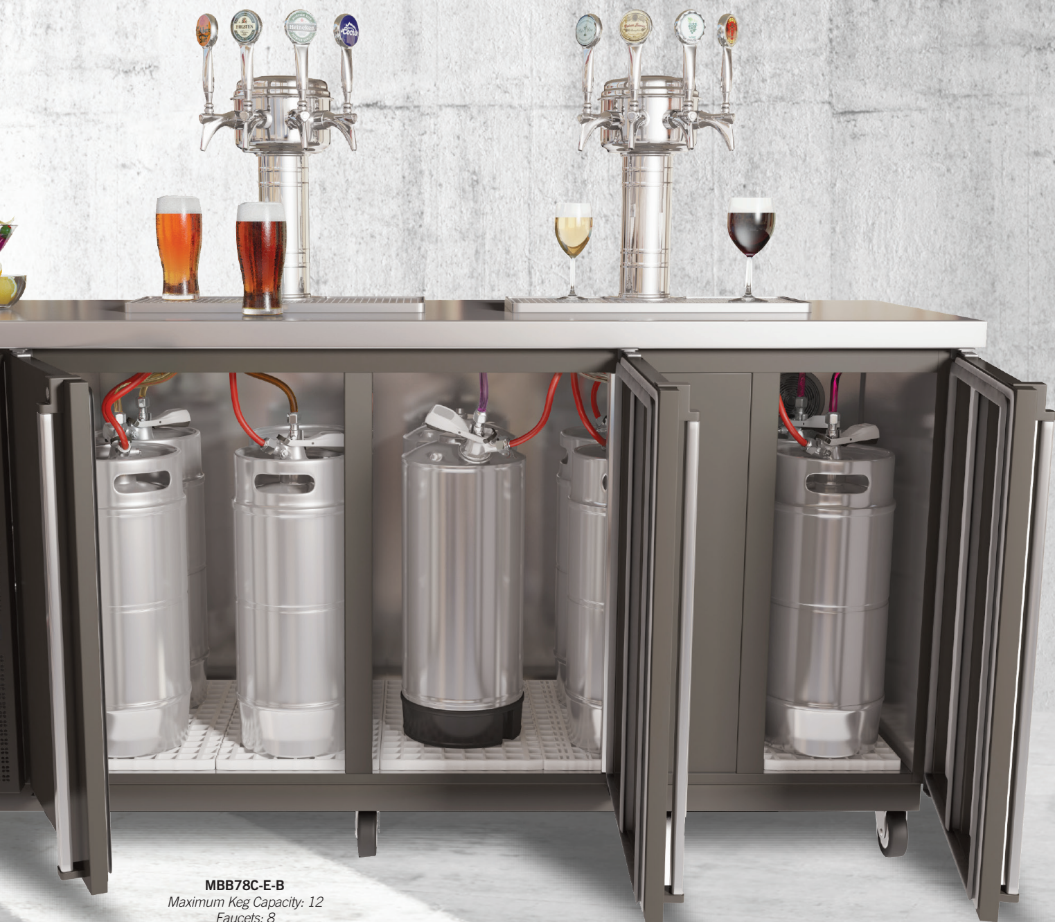
MBB78C-E-B Maximum Keg Capacity: 12 Faucets: 8