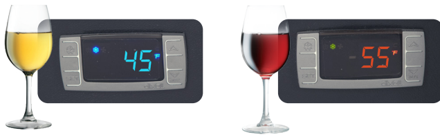
Dual-Temperature: Built In Digital Thermostats