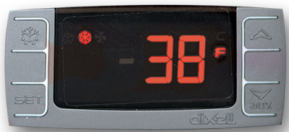
Adjustable Digital Thermostat! Easy to read exterior mounted