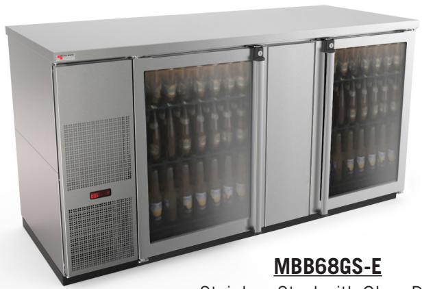
MBB68GS-E Stainless Steel with Glass Doors