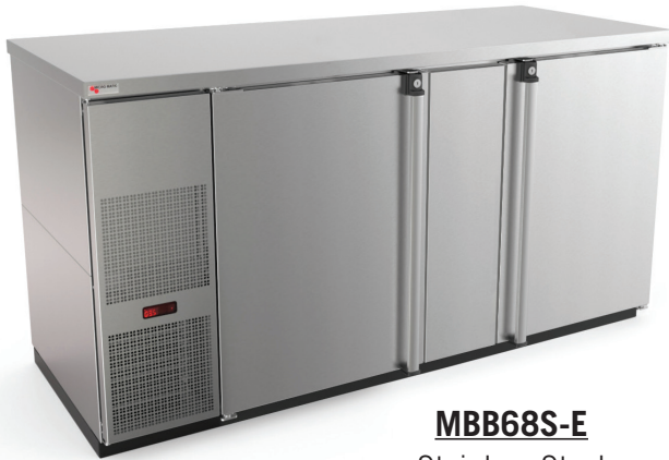
MBB68S-E Stainless Steel