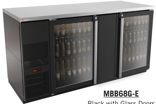
MBB68G-E Black with Glass Doors