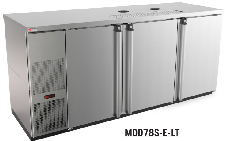
MDD78S-E-LT Stainless Steel